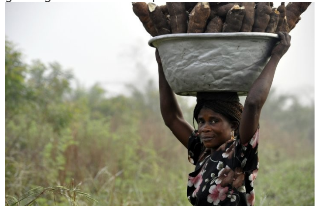
Charity with a load of cassava

This journey was not just to another land, but another culture; to a place where community is organized in villages and the rhythm of life is guided by the growing season and the quest for food