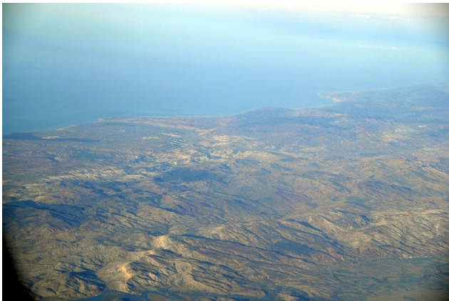
over the Mediterranean Sea into north Africa